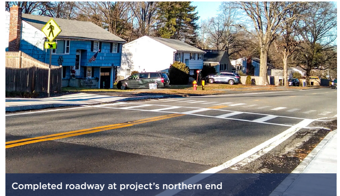
Completed roadway at project's northern end