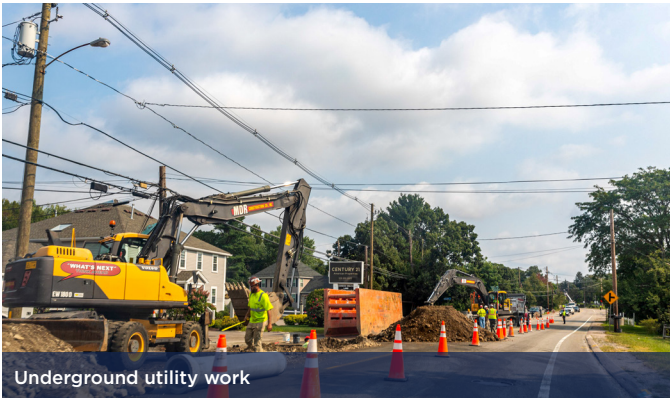
Underground utility work