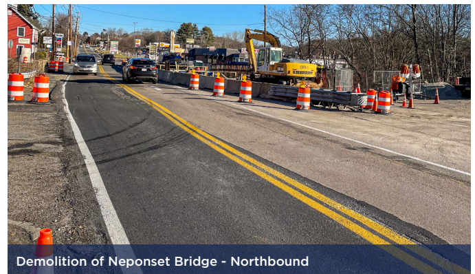
Demolition of Neponset Bridge - Northbound