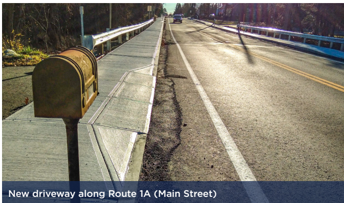
New driveway along Route 1A (Main Street)

This project's scope also includes replacing the bridge carrying Route 1A over the Neponset River. The bridge is being demolished and rebuilt one lane at a time to maintain two lanes of traffic throughout construction. The contractor began demolishing the bridge in fall of 2021. A timelapse video of the bridge work can be viewed on the project webpage. As of fall 2022, the contractor has demolished and reconstructed the northbound side of the bridge. Work will recommence next construction season.